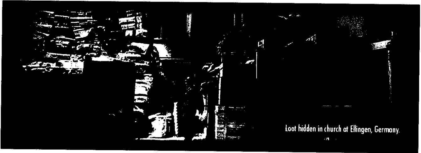
Loot hidden in church at Ellingen, Germany.