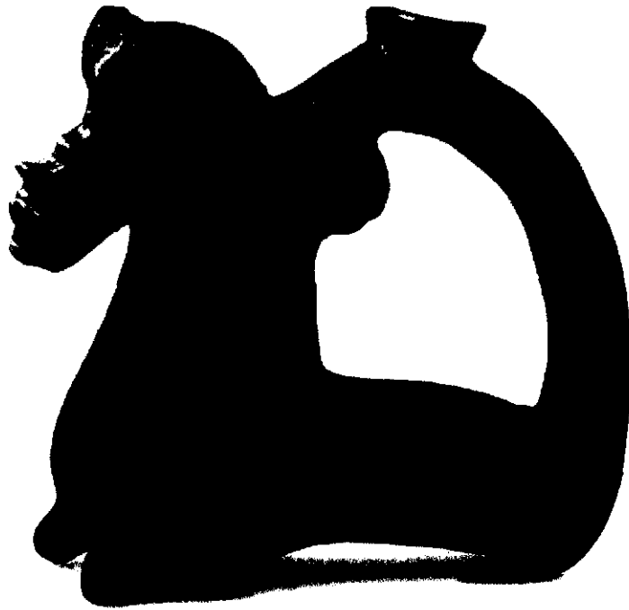
Fig. 4 Peruvian Artifact