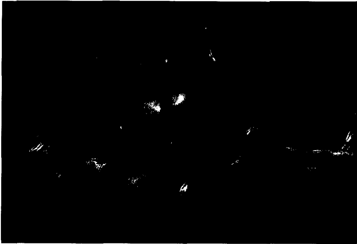
Fig. 2 “Still Life with Fruit and Game” By Frans Snyder (1615)