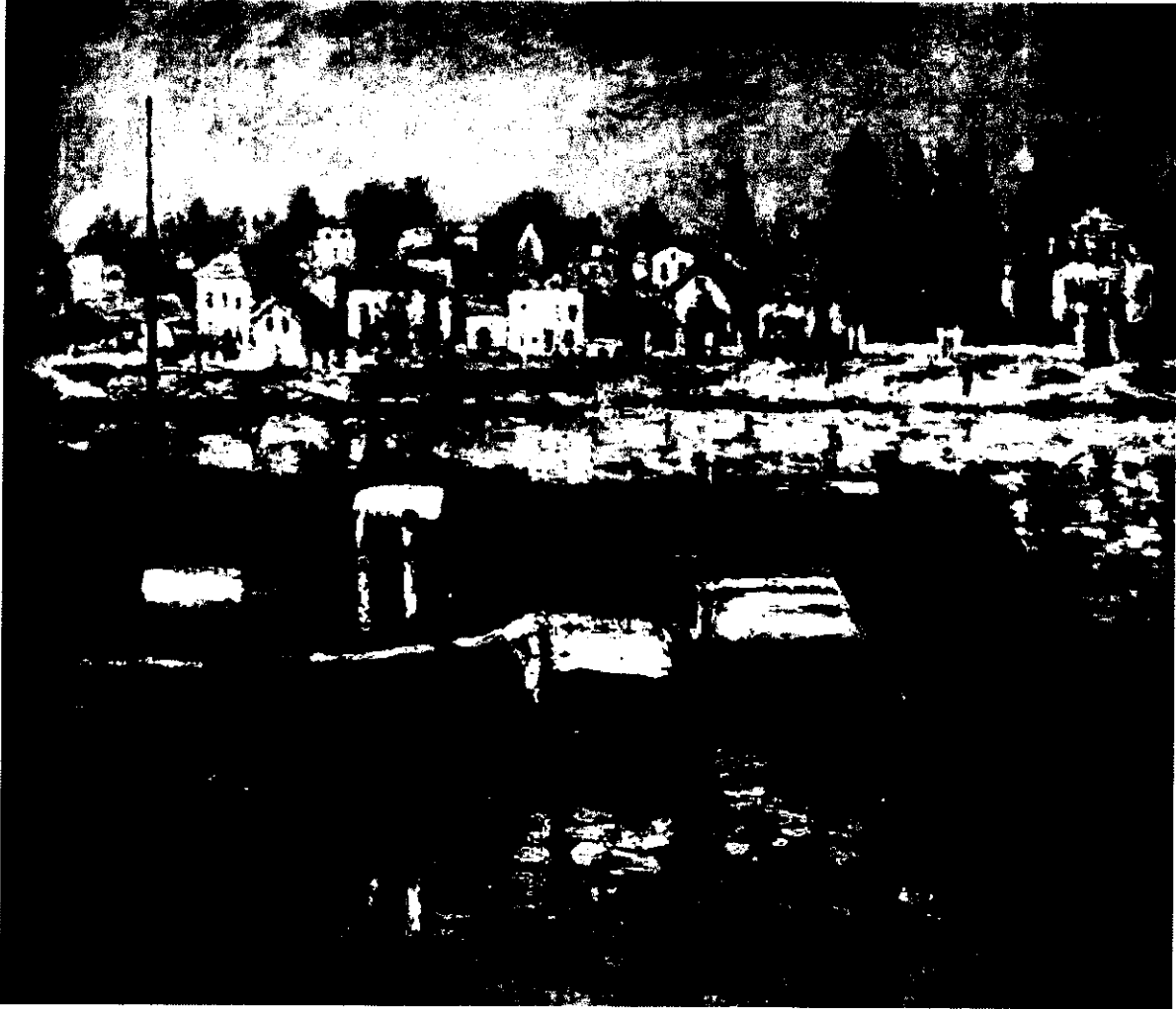
Fig. 1 “Seine at Asnières” by Claude Monet (1873)