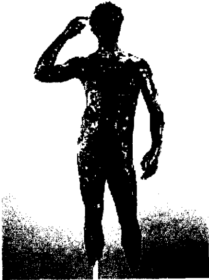
Fig. 5 “Victorious Youth”